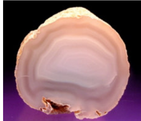
picture of pink agate limb cast from Texas Springs