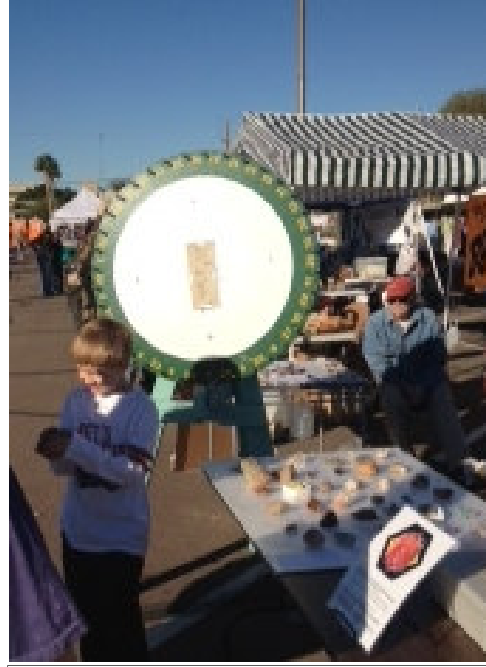
MSA Wheel Winner