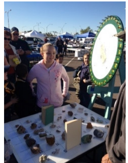
One of Our Hopeful (and probably repeat) Customers